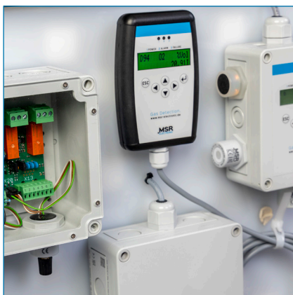
Removable hand tool STL-06

Dimensions (WxDxH): approx. 546 x 423 x 250 mm