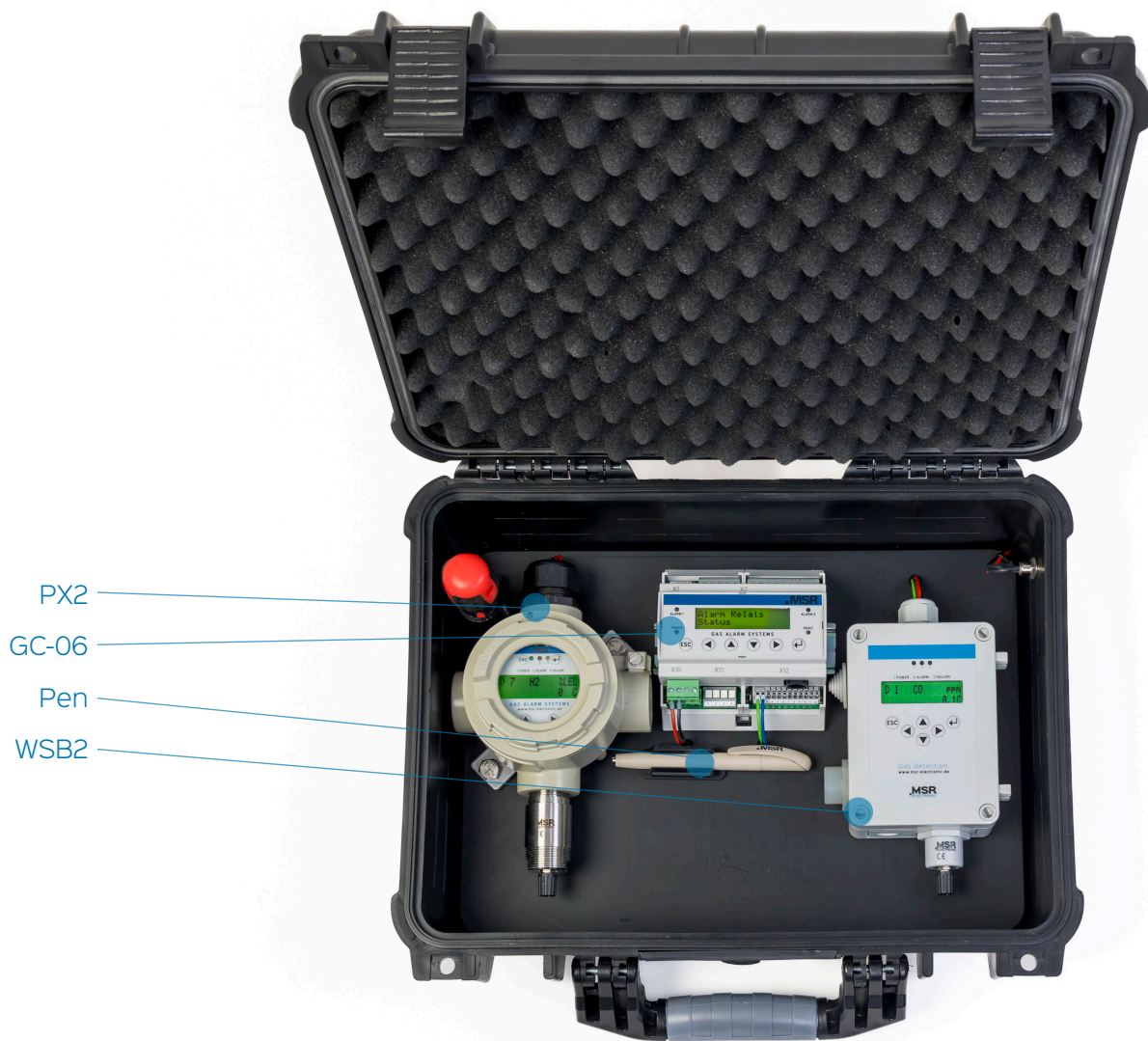
Illustration similar, product subject to change