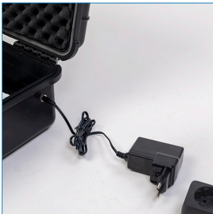
Power connection directly on the case

Dimensions (WxDxH): approx. 410 x 320 x 175 mm