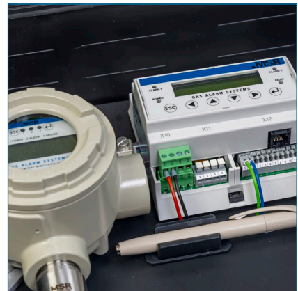
Devices ready for immediate use